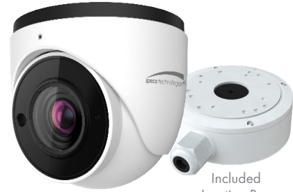
Included Junction Box